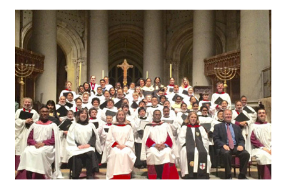
Clergy and singers at the Diocesan Treble Festival.