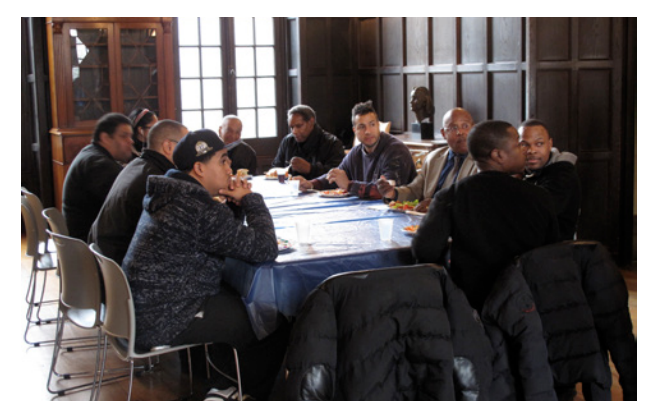
Members of the Cathedral's Maintenance and Facilities team.

and the staff are accustomed to helping out where needed, as well as to all-nighters for occasions like the Winter Solstice and New Year's concerts