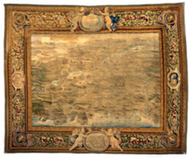
Map of the Holy Land, 17th Century Barberini Tapestry (one of 12)