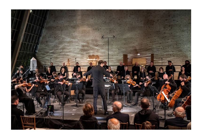
January 26 & 27, 2024 http://bit.ly/Passio-NYC

present Arvo Pärt's Passio A Concert for Peace and Healing