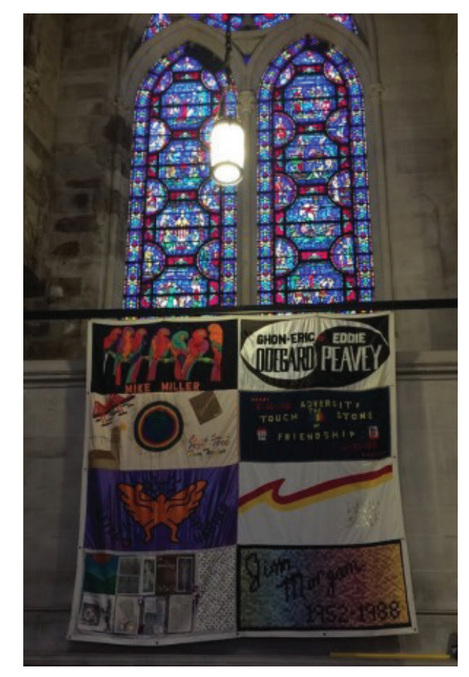
A panel of the NAMES Project AIDS Memorial Quil

We have come such a long, long way in 25 years, but there is still much more to be done. For me, it has been an incredible journey, and I look forward to another 25 years (or even 50 years!) of sharing the Spirit of Pride in the Cathedral