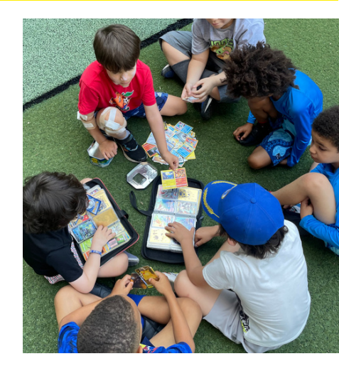
child-centered | diversity | fun | learning | organization | safety | teamwork