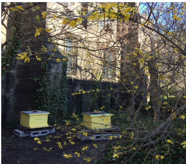
Divine Bees

The following is excerpted from an interview published on the Cathedral's website. To read the full article, visit stjohndivine.org/blog .