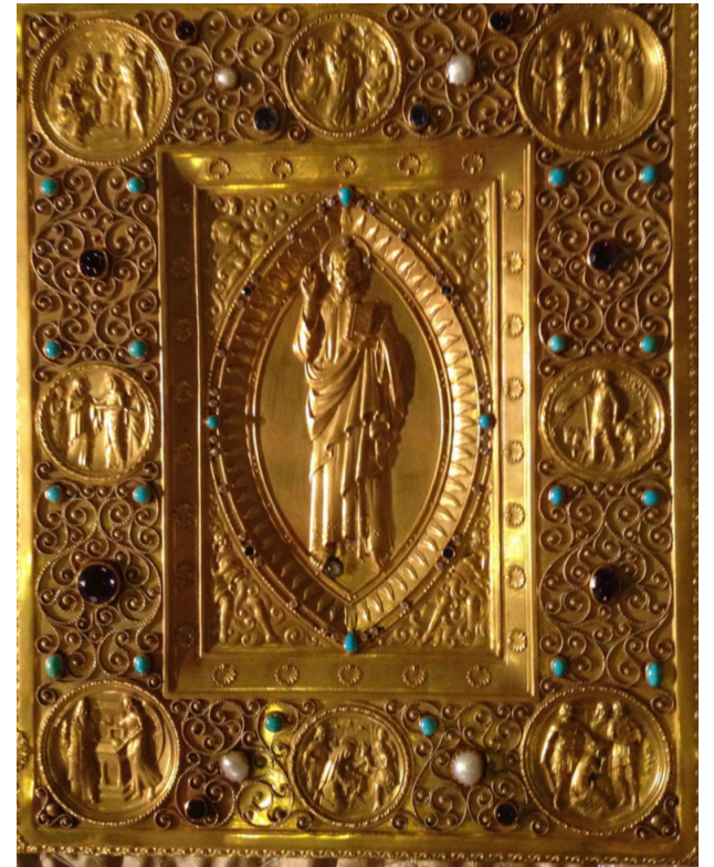
The Stuyvesant Baptismal Book, 1931

Come explore Treasures from the Crypt on your next visit! And while you're here, know that you, too, are a treasure of the Cathedral.