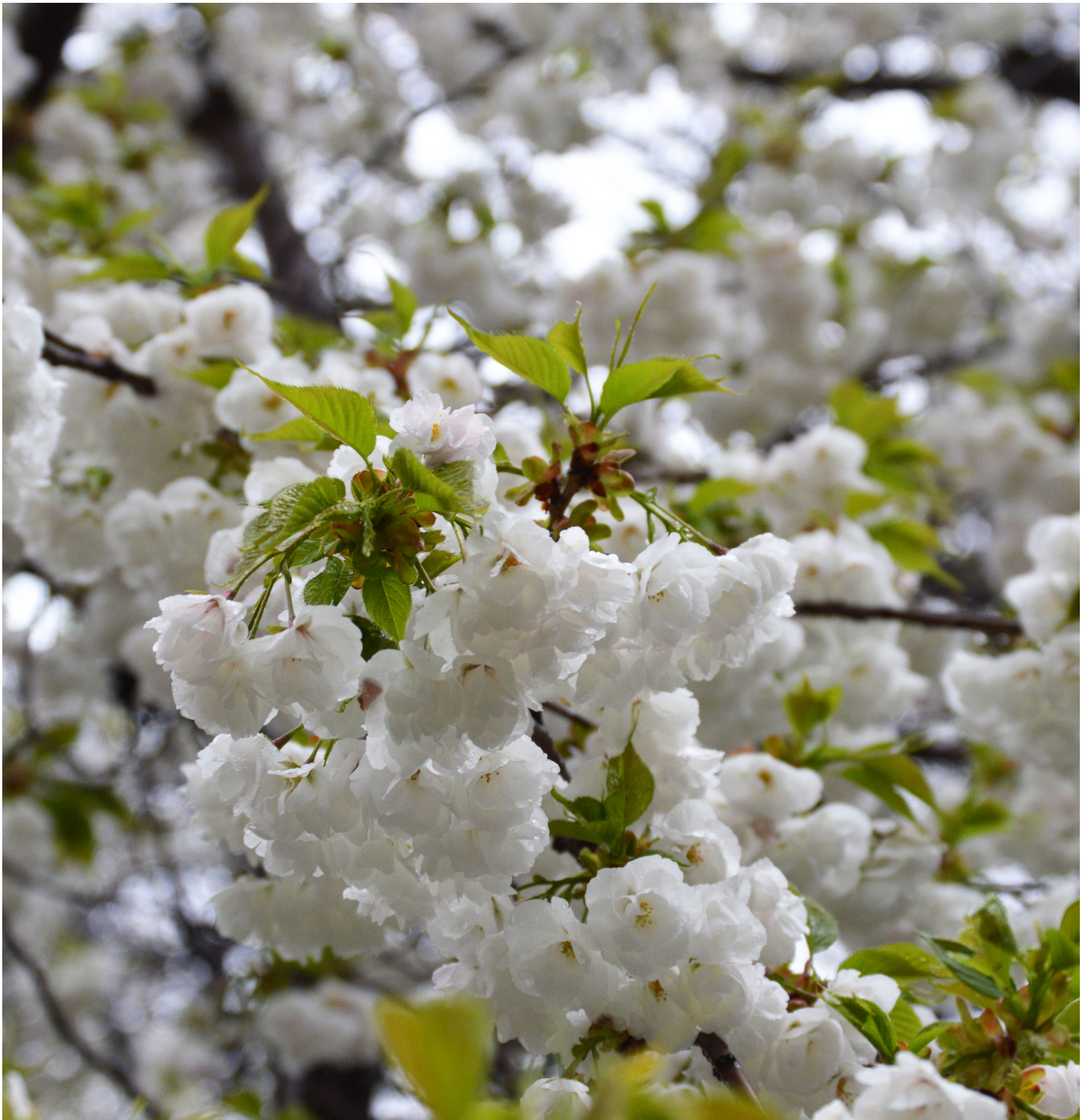
Summer in bloom