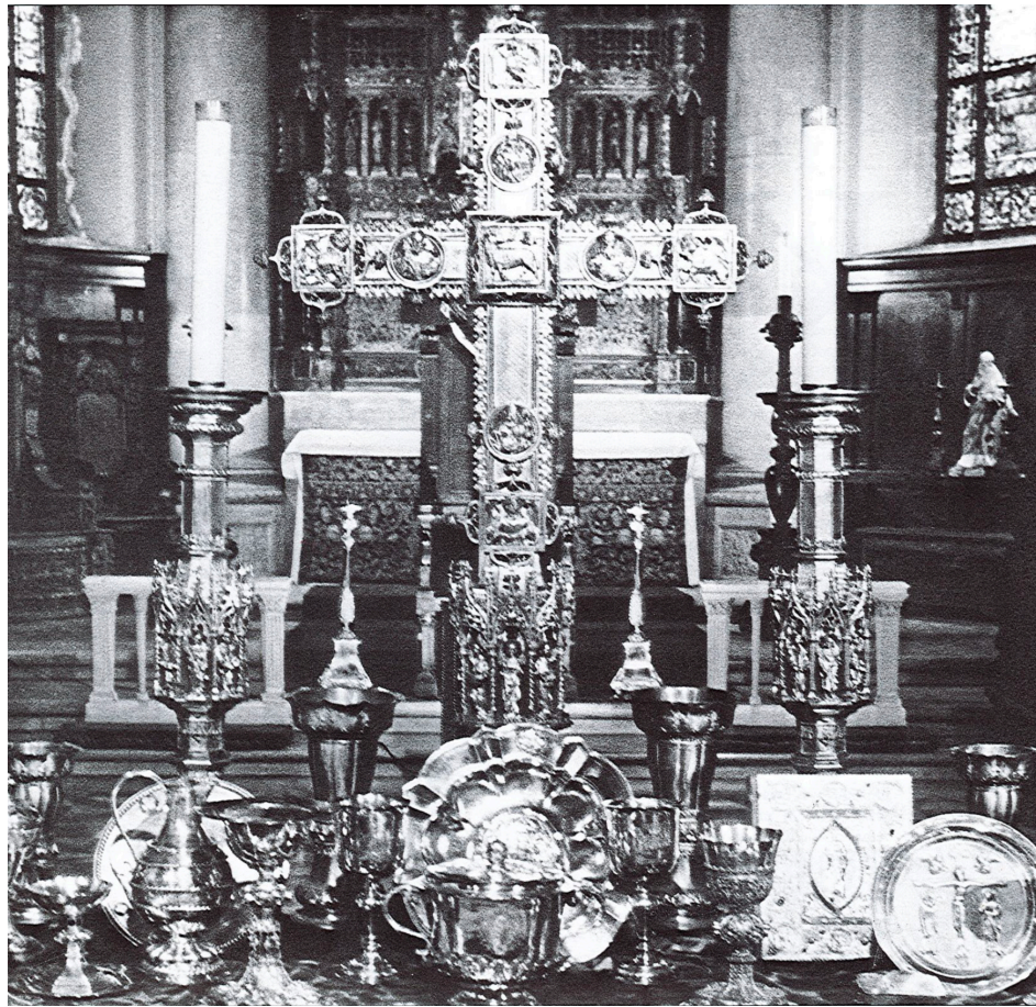
Treasury - Archives

This article was first published in the Cathedral's Fall 2001 newsletter.