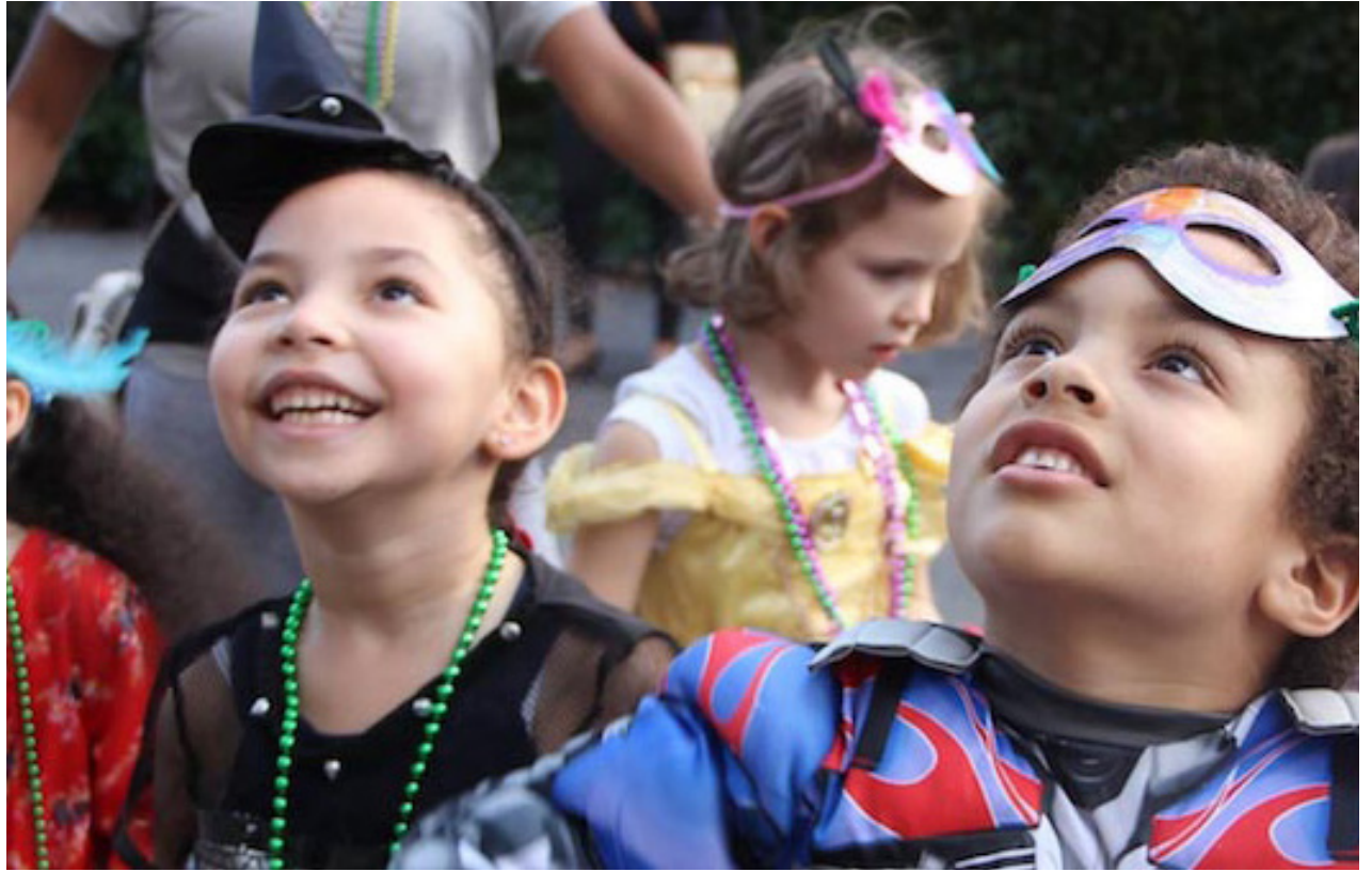
ACT Campers