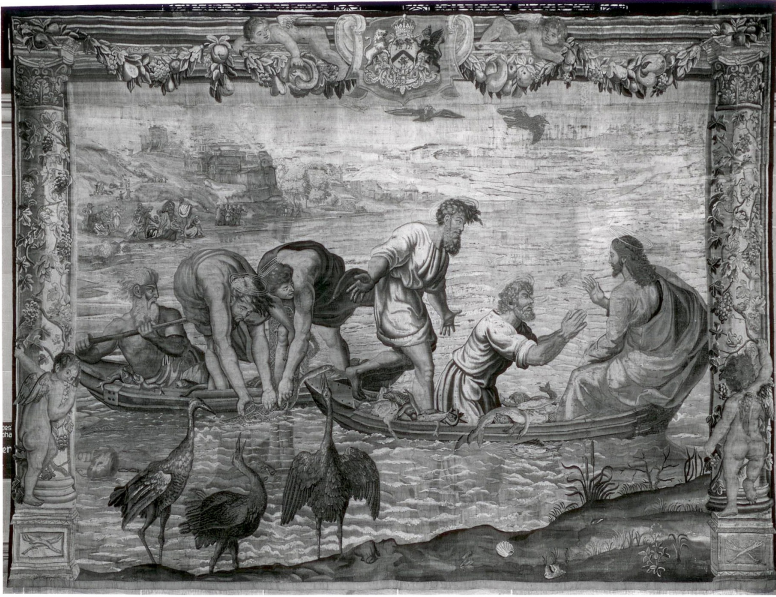
Miraculous Draught of Fish, tapestry from The Acts of the Apostles series, early 1690's

Donated to the Cathedral in 1954, the The Acts of the Apostles tapestries depict events in the New Testament's Book of Acts and are based on designs from Raphael originally commissioned by Pope Leo X and woven by Flemish master weaver Pieter van Aelst between 1517 and 1521 to fill the lower walls of the Sistine Chapel. After years of hanging in the Cathedral experiencing expected wear, the Textile Conservation Lab plans to continue the extensive cleaning and treatment of The Acts of the Apostles that is long overdue.